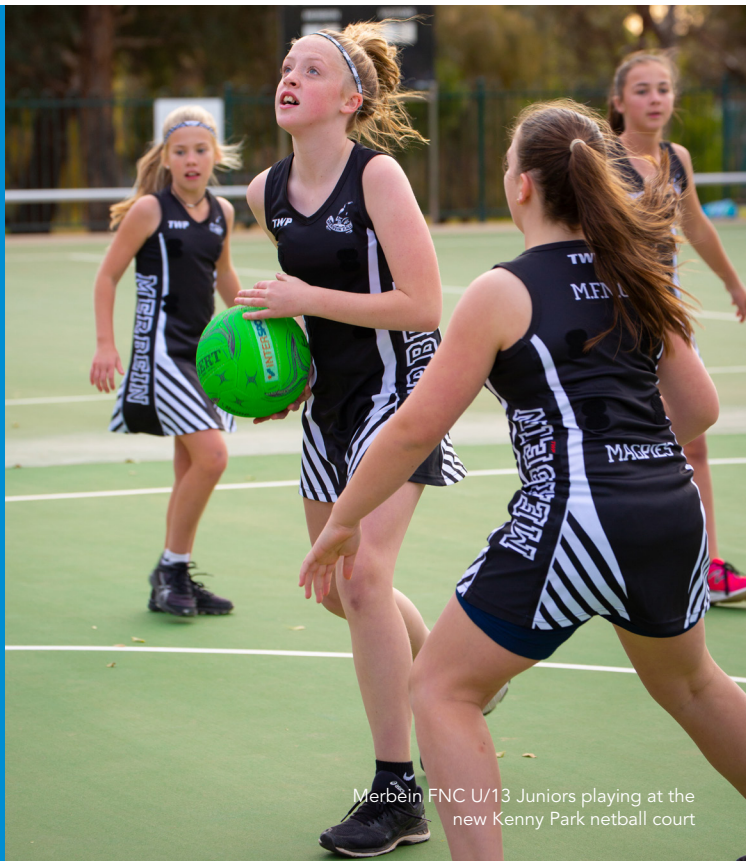
Merbein FNC U/13 Juniors playing at the new Kenny Park netball court

For more information on eligibility requirements and the application process contact Council's Community Futures branch on (03) 5018 8100.