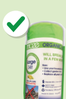
Maze Organic Bags