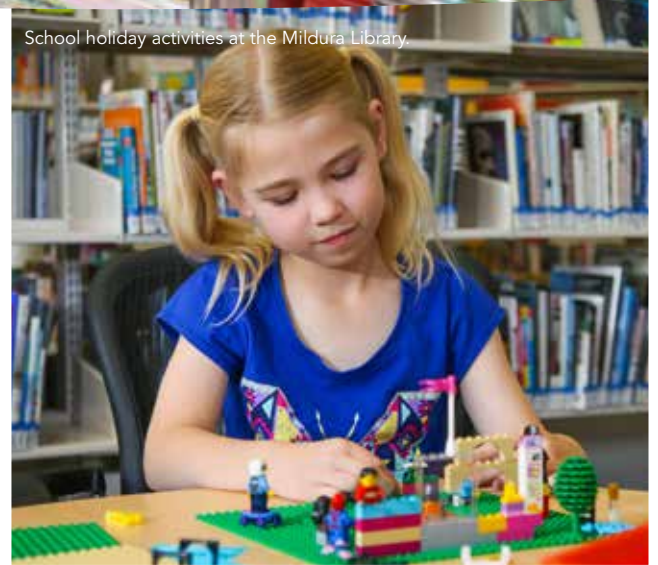
School holiday activities at the Mildura Library

The National Gallery of Victoria's NGV Kids on Tour program will come to Mildura Arts Centre this summer. Children can engage with art at two free hands-on workshops. Inspired by the theme of Everybody can Play, Make and Move , a workshop on January 9 will suit 4-12 year olds, and 12-18 year olds will enjoy a workshop on January 11. Bookings are essential and can be made by calling Mildura Arts Centre on (03) 5018 8330.