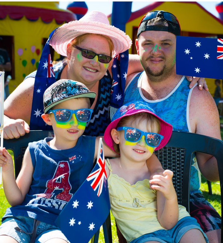
LEFT Community Event of the Year recipients Sunraysia Gang Show ABOVE Locals enjoying the festivities at Nowingi Place

Year 11 and 12 students the skills they are going to need throughout their life, including cooking.