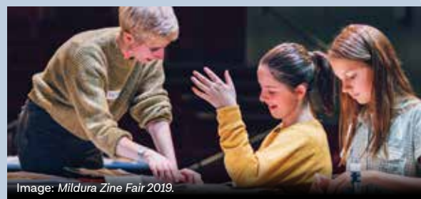
Image: Mildura Zine Fair 2019.

See a brilliant array of catch-your-breath stunt work, acrobatics, juggling and the side-splitting, slapstick comedy. Ages 5+