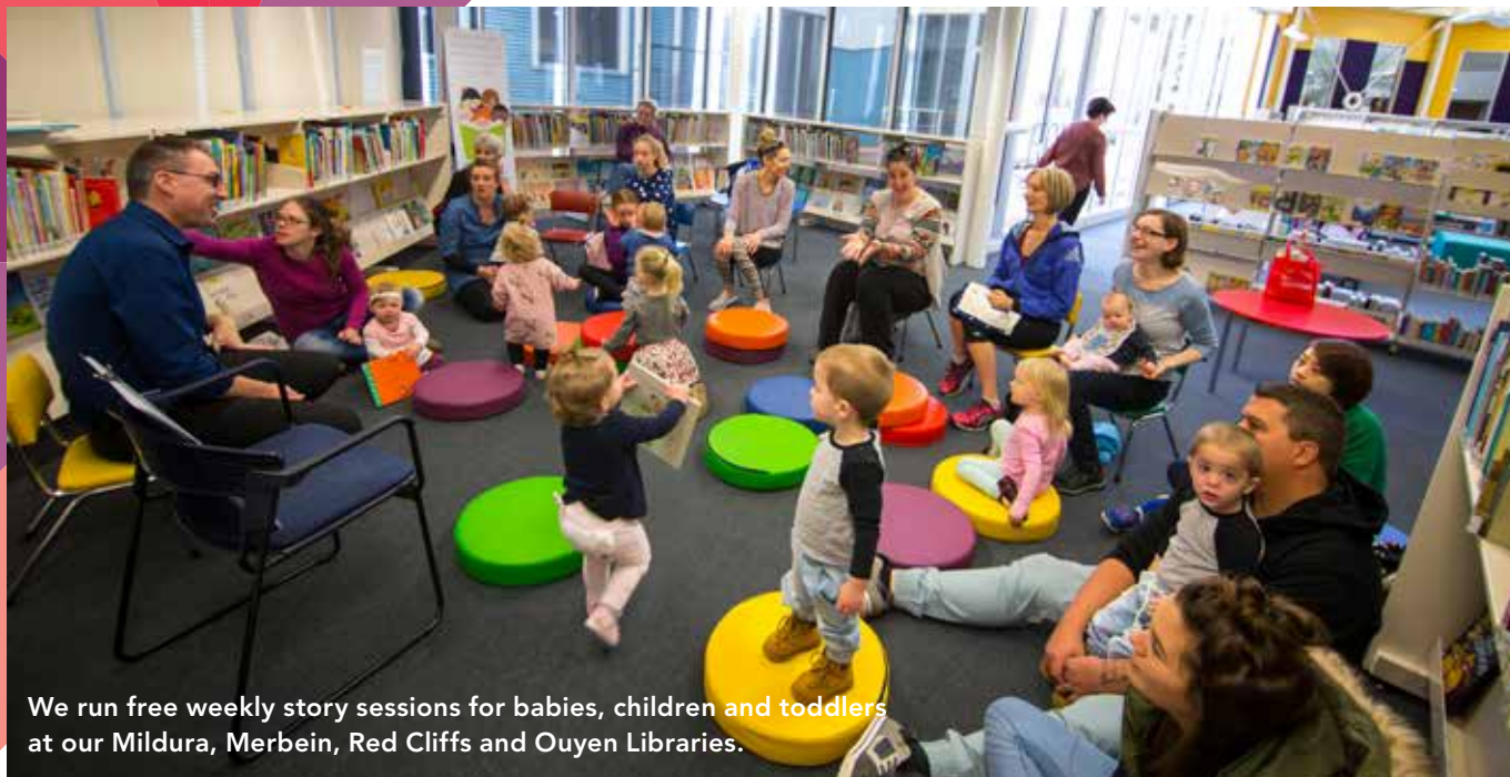
We run free weekly story sessions for babies, children and toddlers at our Mildura, Merbein, Red Cliffs and Ouyen Libraries.