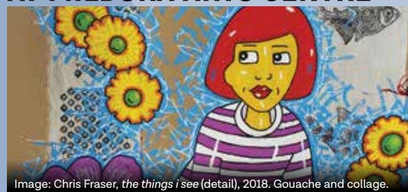
Image: Chris Fraser, the things i see (detail) , 2018. Gouache and collage.