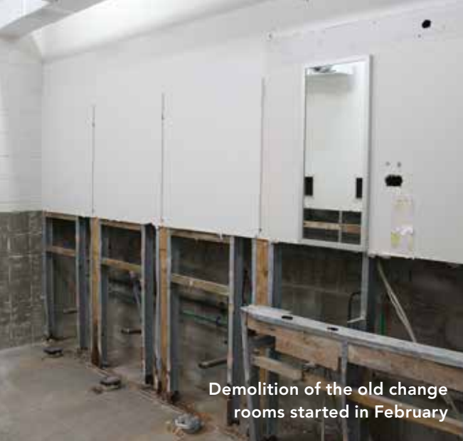
Demolition of the old change rooms started in February