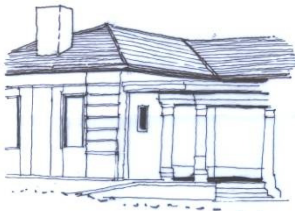
Stripped classicism ( 1920-1940)

The economy of construction, however, also recalls the economic difficulties faced by the first settlers, and they are expressed today in the remaining portions of shop front architecture in Indi Avenue and Ilex Street.