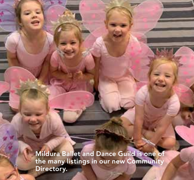
Mildura Ballet and Dance Guild is one of the many listings in our new Community Directory.