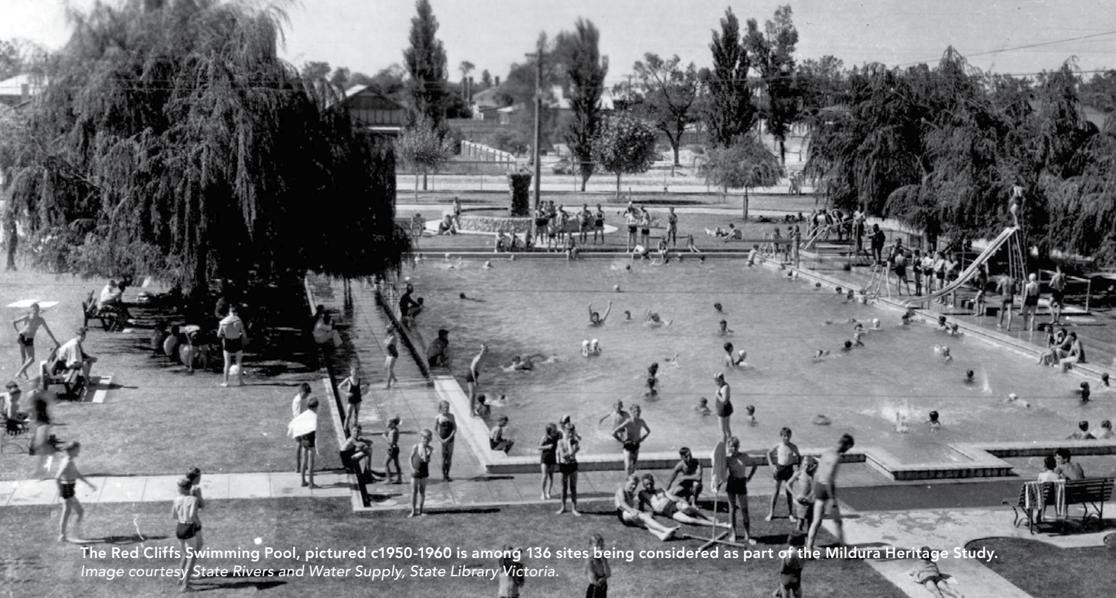
The Red Cliffs Swimming Pool, pictured c1950-1960 is among 136 sites being considered as part of the Mildura Heritage Study.