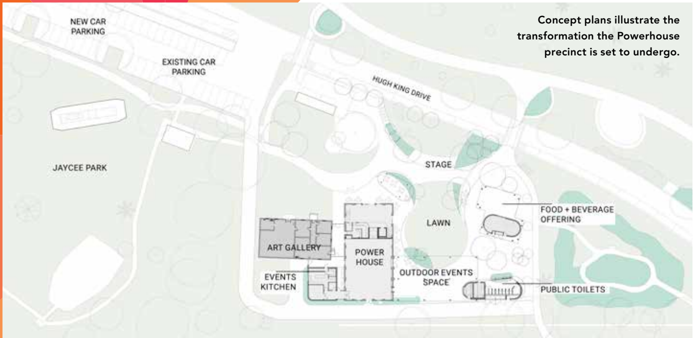
Concept plans illustrate the transformation the Powerhouse precinct is set to undergo.