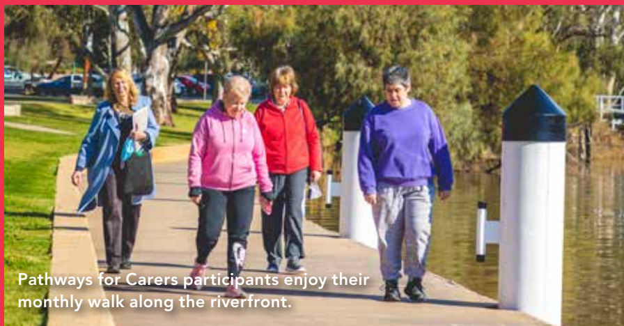
Pathways for Carers participants enjoy their monthly walk along the riverfront.

The monthly walks include complimentary morning tea and information sessions with local service providers. They also allow time for carers to discuss their own situations with each other, ask questions about services, and find recommendations they may want to access with other carers.