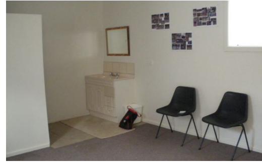
Inside netball change room