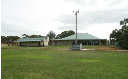
New pavilion and refurbished change rooms