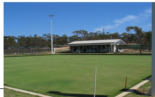
Lawn bowls facilities