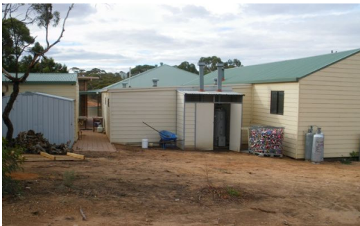
Rear of football / cricket change rooms (right). Netball change room to the left