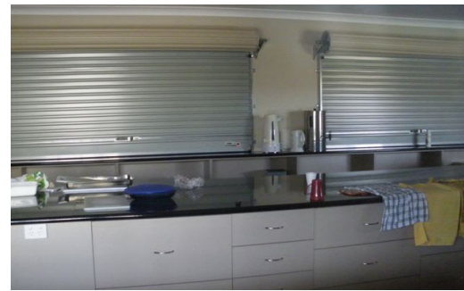
Inside new pavilion – commercial kitchen