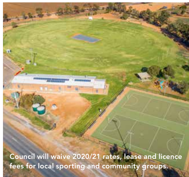
Council will waive 2020/21 rates, lease and licence fees for local sporting and community groups.

For more information about these measures and the support you may be entitled to, visit www.mildura.vic.gov.au/Coronavirus