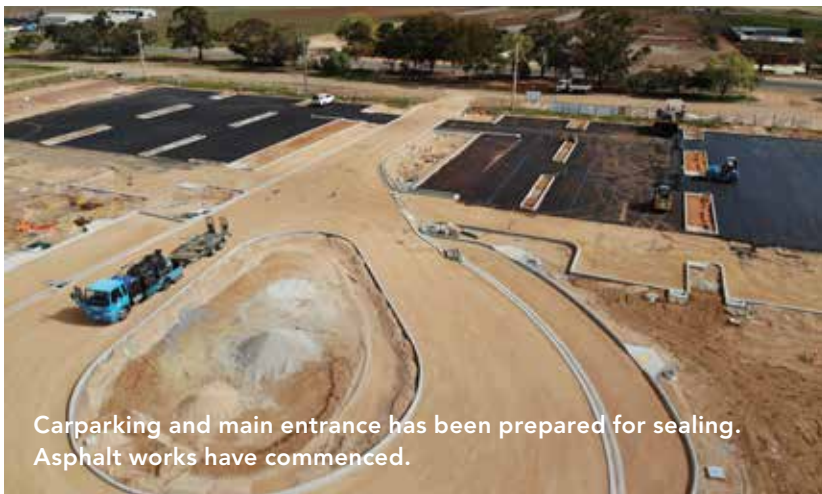
Carparking and main entrance has been prepared for sealing. Asphalt works have commenced.