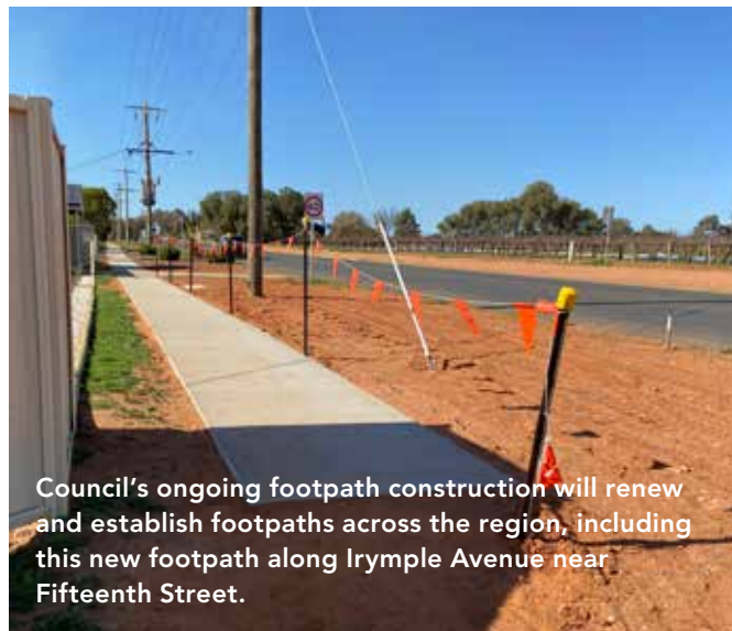
Council's ongoing footpath construction will renew and establish footpaths across the region, including this new footpath along Irymple Avenue near Fifteenth Street.