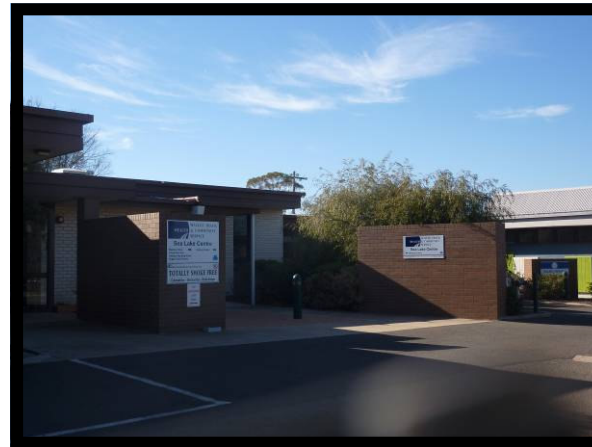
Recharge point at Sea Lake Hospital

Please contact the Rural Access Worker at Council for further information if you are interested.