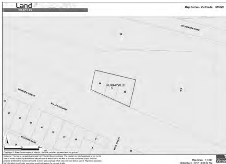
Murrayville Railway Housing Precinct

Name Murrayville Railway Housing Precinct Address 30, 32 and 34 McKenzie Street MURRAYVILLE Place Type Residential Precinct, Staff quarters Citation Date 2012