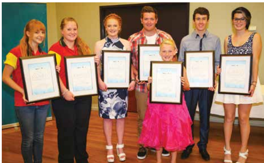
The Mildura Rural City Council Youth Award winners for 2016