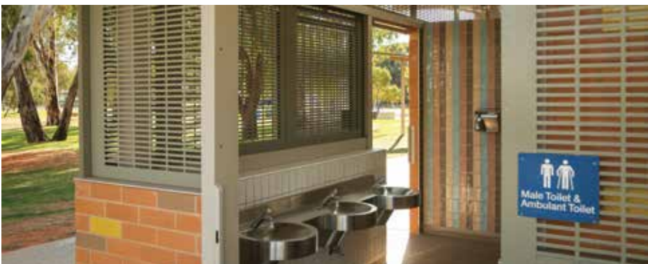
The toilet facilities at The Nowingi Place on the riverfront are a great example of CPTED designed public buildings.

Advances in tree management methods and knowledge have improved how we can care and maintain sugar gums. Council will now work towards providing a safe environment for motorists and pedestrians alike, and also ensure that our children's children will be able to enjoy Deakin Avenue and it will remain an iconic vista for all those who live or visit our region.