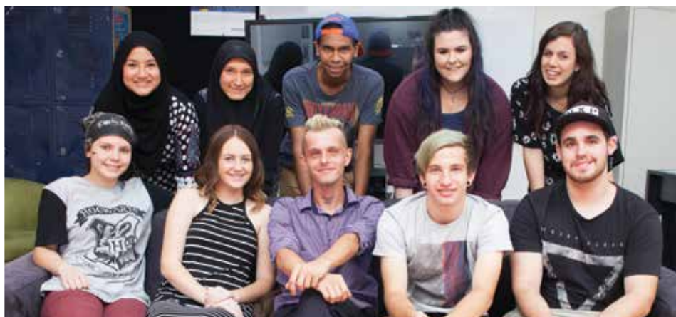
Some of the great new people joining the 2016 FReeZA Committee