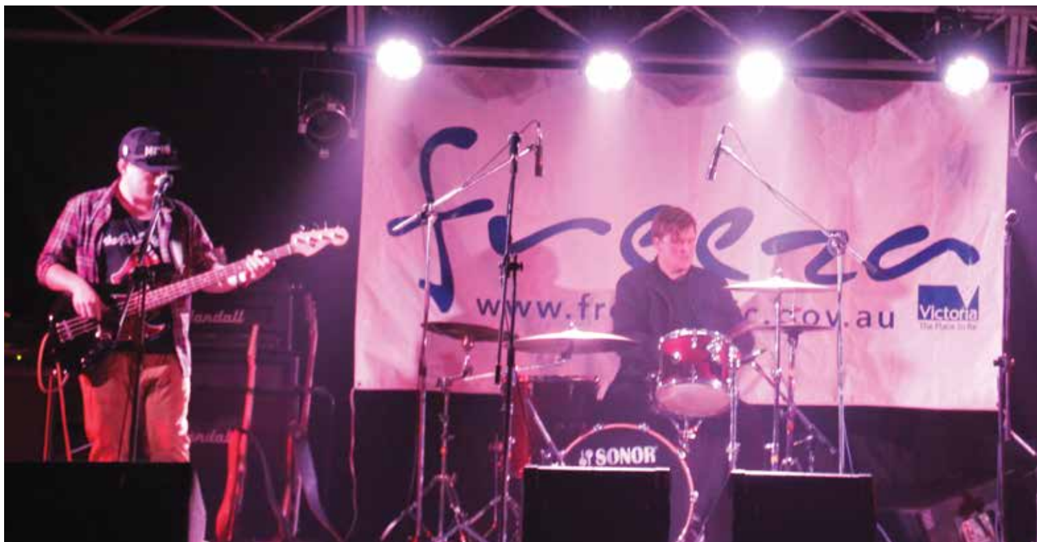
2016 Push Start Comp winners Overwound.